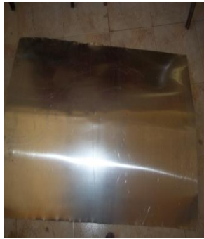
aluminium sheet metal