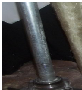
Pipe & car bearing fitted among others