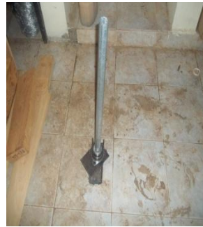
Galvanized Iron pipe